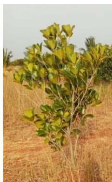
SHANKARA (Red flesh)