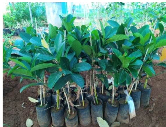
Fig.4. Approach grafting of jackfruit