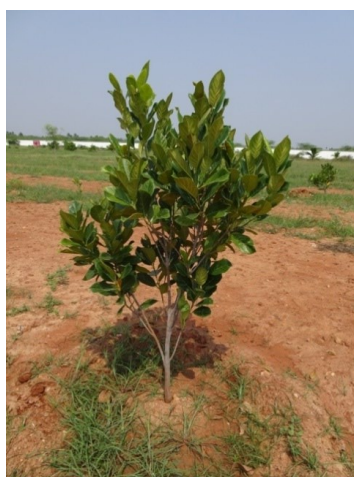
Fig.5. Field view