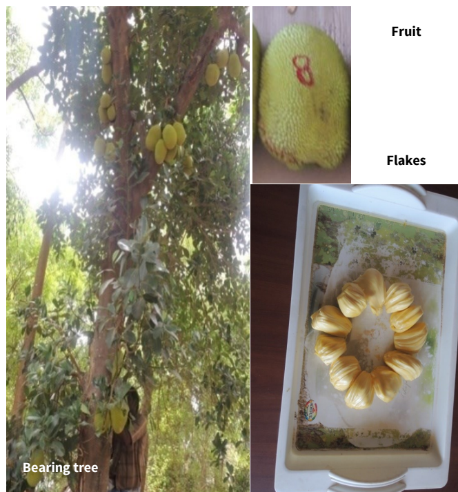
KDM-AHJ-08 Jackfruit Germplasm

Fig. 2. Small-sized fruit suitable for small families