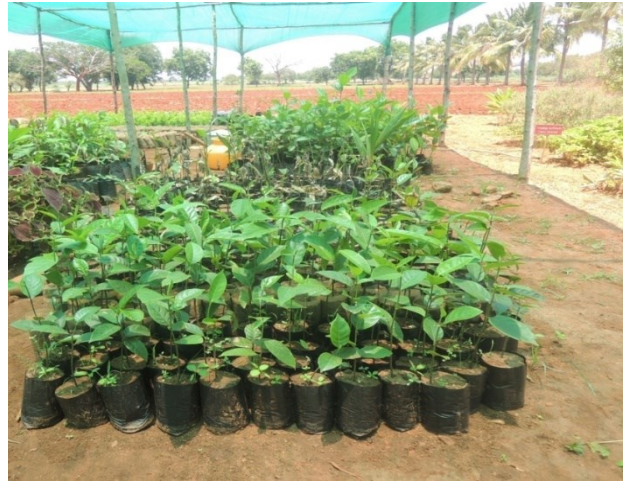
Softwood grafting of jackfruit was done in March 2019, July 2019 and November 2019