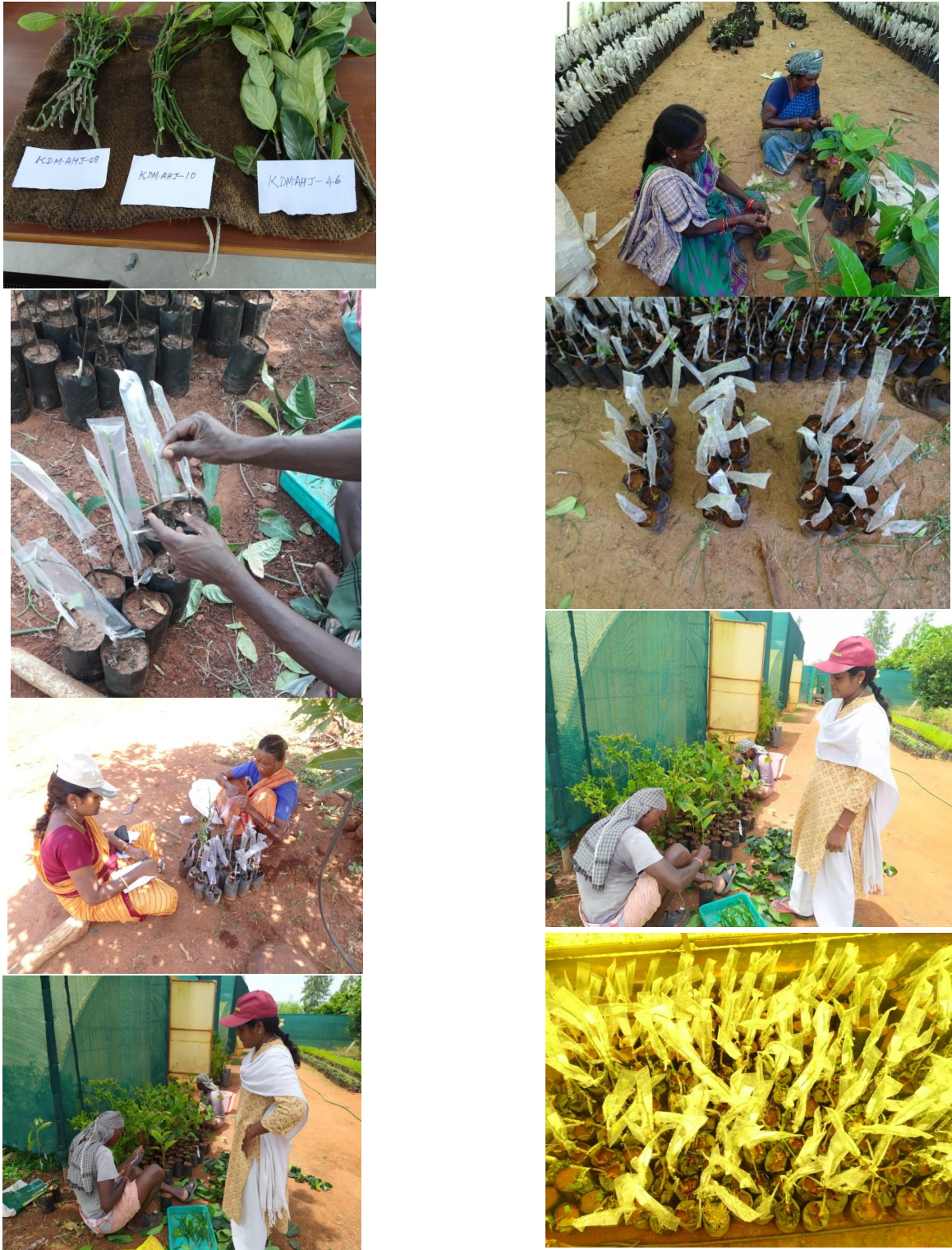
Success of grafted plants