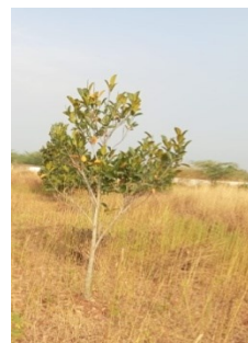
SIDDU (Red flesh)