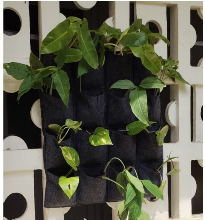
Fig. 1. Setting up a felt - integrated living wall.

a) Planting in module (b) Sheet is covered with foliage