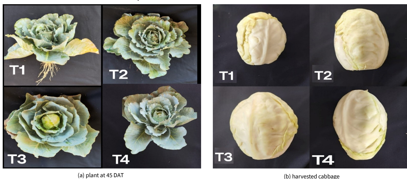
Fig. 1. Images of cabbage under different production systems

Various production systems significantly influenced LAI, SPAD, CGR and RGR during the different growth stages of the crop. Application of organic practices recorded a higher LAI (1.05) at the harvest stage, which was on par with conventional farming practices. The lowest leaf area index was (0.84) observed at the harvest stage in absolute control. The highest chlorophyll content was (59.65) recorded at harvest when applying organic farming practices. The next best reading value was observed with (57.24) conventional farming practices, which is on par with natural farming practices. The significantly lowest chlorophyll content was (45.78) observed in absolute control.