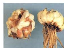
On the left side: scale rot; on the right side: bulb rot