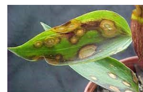
Table 6. Pest of Lilium .