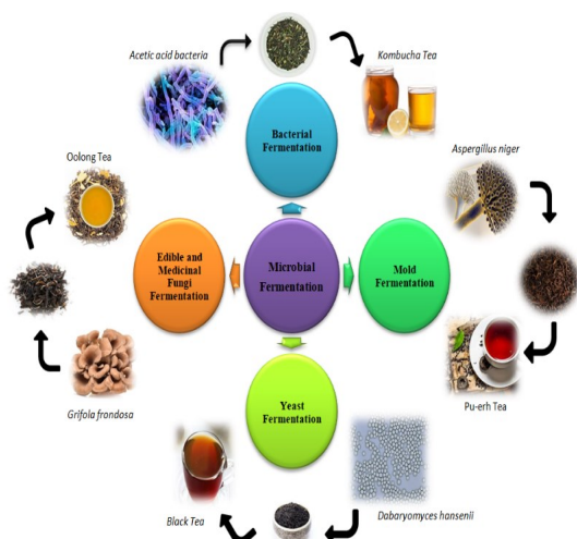
Fig. 3. Fermented tea types.

Fermented tea is produced through a specialized process involving picking, withering, rolling, fermenting and drying. This type of tea constitutes only a minimal portion of the overall production of infusions. As shown in Fig. 3, microbiologically fermented tea can be categorized into 4 distinct types based on the organisms used for fermentation: tea fermented by molds, bacteria, yeasts and fungi, each contributing to unique flavors and potential health benefits.