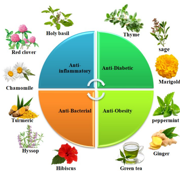
Fig. 4. Therapeutic features and some suitable herbs.

various health benefits. The global popularity of green tea, which has gained attention due to its high concentration of catechins and other bioactive constituents (60). While green tea is widely consumed for its antihypertensive, anticancer and antibacterial effects, excessive consumption may lead to adverse effects such as gastrointestinal disturbances and hepatotoxicity. This dual aspect of green tea-its benefits and potential risks-further illustrates the complexity and importance of ongoing research into phytochemicals and