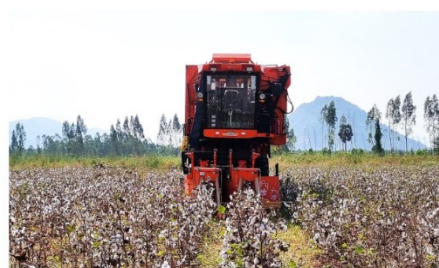
Spindle-type cotton picker used for cotton harvesting