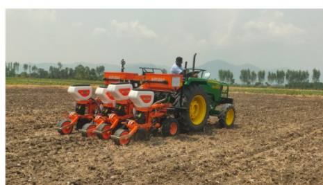
Sowing by pneumatic precision planter