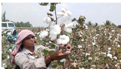
Hand picking of seed cotton