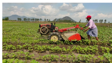
Weeding done by power weeder @ 25 DAS