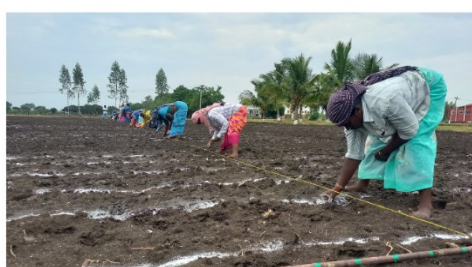
Sowing by hand