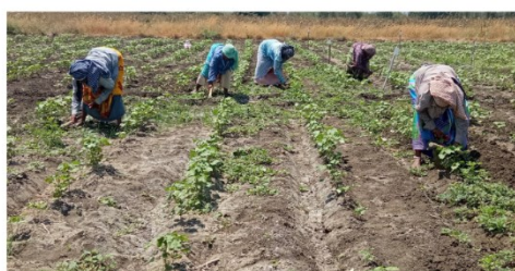
Hand weeding @ 25 DAS