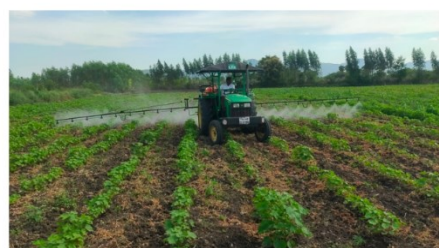
PGR and Pesticide spray by tractor mounted boom sprayer