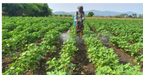
PGR and Pesticide spray by battery operated sprayer