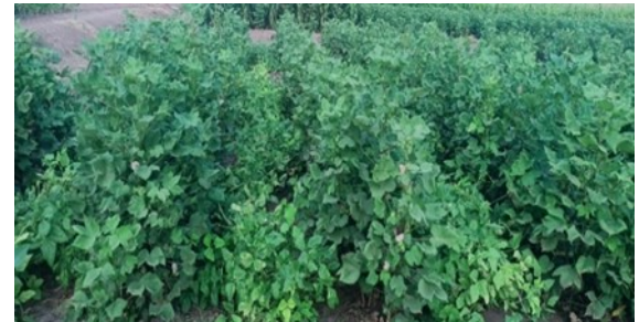
S 4 - Cotton + cowpea (1:1)