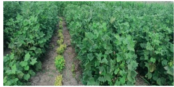
S 2 - Cotton + groundnut (1:1)