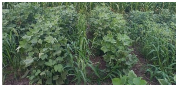
S 5 - Cotton + prosomillet (1:1)