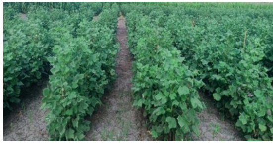
S 1 - Sole cotton (1:1)