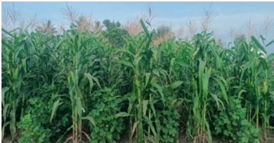
S 3 - Cotton + maize (1:1)