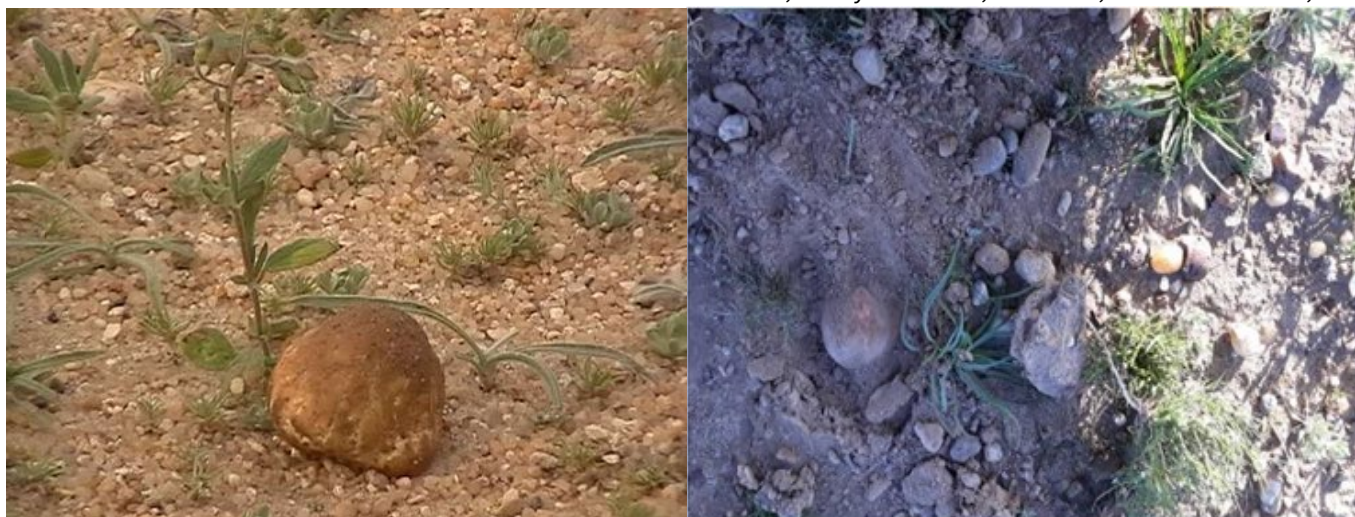
Fig. 1. The desert truffle T. boudieri and its host plant H. aegyptiacum (L.) Mill. growing under natural conditions.

The truffle T. boudieri and the young leaves of the host plant H. aegyptiacum (L.) Mill. were air-dried and transported to the laboratory for extraction. The truffle samples were dried in an oven at 35–40°C and then ground to a fine powder using a blender. The truffle T. boudieri and the host plant H. aegyptiacum (L.) Mill. were turned into fine powder using a mortar and preserved in well-stopped bottles for phytochemical analysis. The experiments were repeated twice, and the mean values were determined. 100 grams of the powdered samples were extracted using hexane, ethyl acetate, ethanol, and methanol, in