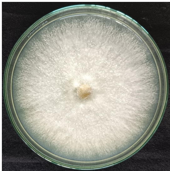
Fig. 3. Mycelial growth of C. rosea in optimized condition.