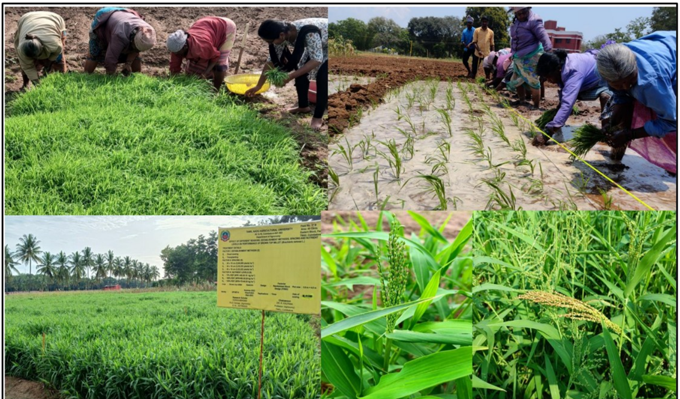
Fig. 2 Overall view of field experiment A) Nursery B) Transplantation C) Field view D) Grain filling stage E) Maturity stage