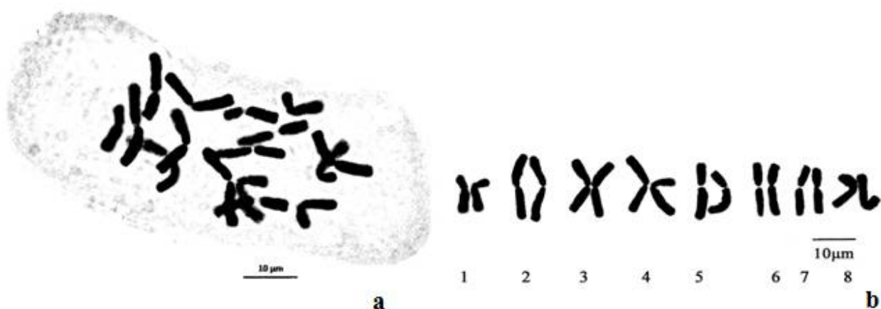
Fig. 1. (a) Mitotic metaphase plate showing 2n = 16 chromosomes (b) karyogram of Allium sativum

The somatic chromosome number of Allium sativum was found to be 2n=16 (Fig. 1) which corroborates previous findings (1, 3). Numerical data of the karyotype of A. sativum revealed that its chromosomes are either metacentric or submetacentric in nature (Fig. 1) and their length ranged from 9.24 \mu m to 16.17 \mu m (Table 1). This also indicates the absence of acrocentric or telocentric chromosomes in its karyotype. Based on quali-quantitative estimation, the inter-chromosomal and intra-chromosomal indices of A. sativum were found to be 1.75 and 1.00