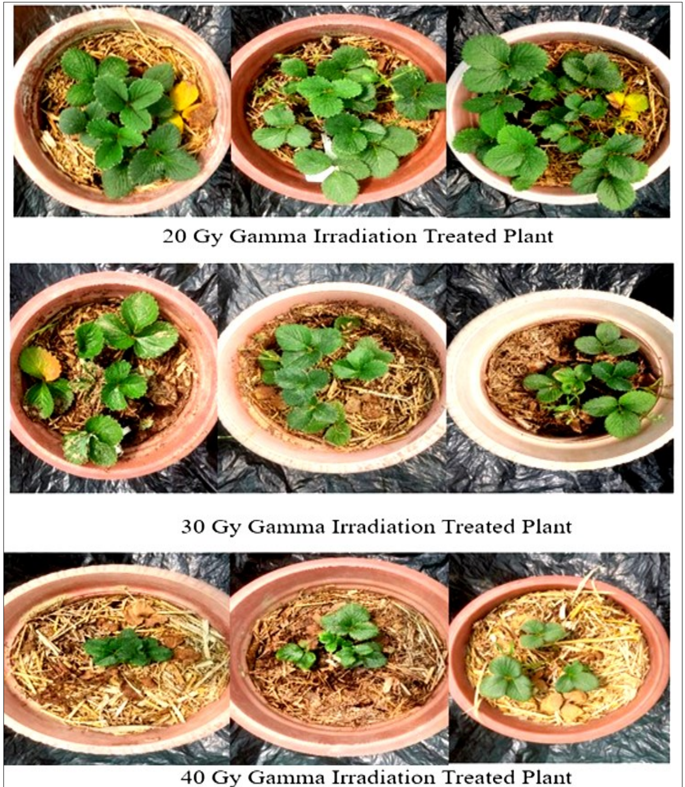
Fig. 2. Different doses of gamma irradiation and their effects.

The plants were clipped to eliminate dead leaves, runners and flowers prior to undergoing irradiation treatment. Then, after being split up into 3 groups and given varying doses of gamma irradiation, they were carefully placed in irradiation containers. The treatment duration for each radioactive dose decay was documented during the runners' treatment and the plants were allocated into 3 groups for 3 doses (Table 1). There were 4 groups of runners: 25 untreated (control) runners, 25 runners of 20 Gy, 25 runners of 30 Gy and 40 Gy-treated runners.