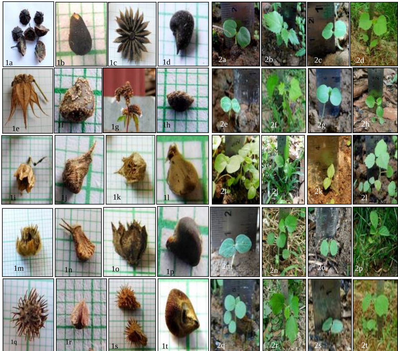
Plate 1. Abroma augusta . (1a: Fruit, 1b: Seed, 2a: Paracotyledon, 2b: mature seedling). Abutilon indicum (1c: Fruit, 1d: Seed, 2c: Paracotyledon, 2d: mature seedling). Hibiscus surattensis (1e: Fruit, 1f: Seed, 2e: Paracotyledon, 2f: mature seedling). Melochia corchorifolia (1g: Fruit, 1h: Seed, 2g: Paracotyledon, 2h: mature seedling). Sida acuta (1i: Fruit, 1j: Seed, 2i: Paracotyledon, 2j: mature seedling). Sida cordata (1k: Fruit, 1l: Seed, 2k: Paracotyledon, 2l: mature seedling). Sida cordifolia (1m: Fruit, 1n: Seed, 2m: Paracotyledon, 2n: mature seedling). Sida rhombifolia (1o: Fruit, 1p: Seed, 2o: Paracotyledon, 2p: mature seedling). Triumfetta rhomboidea (1q: Fruit, 1r: Seed, 2q: Paracotyledon, 2r: mature seedling). Urena lobata (1s: Fruit, 1t: Seed, 2s: Paracotyledon, 2t: mature seedling).

Hibiscus surattensis , Melochia corchorifolia . Sida acuta , Sida cordata , Sida cordifolia , Sida rhombifolia , Triumfetta rhomboidea and Urena lobata were collected from different localities of Tripura. The specimens were photographed and