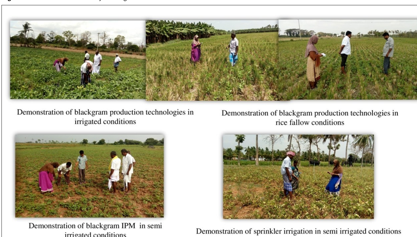
Fig. 3. Photos on demonstration of blackgram production technologies

observed to the tune of 48 % to 76 % with an average of 59.6 % compared to farmers' plots (Fig. 2). The average weed intensity in demo plots recorded was 6.49 m/m 2 when compared to farmers' plots 17.44 m/m 2 while the weed dry weight was to the tune of 3.99 and 10.61 respectively in demo and farmers plots (supplementary data table 1). These observations depicted that weed-free plots certainly yield higher yields.