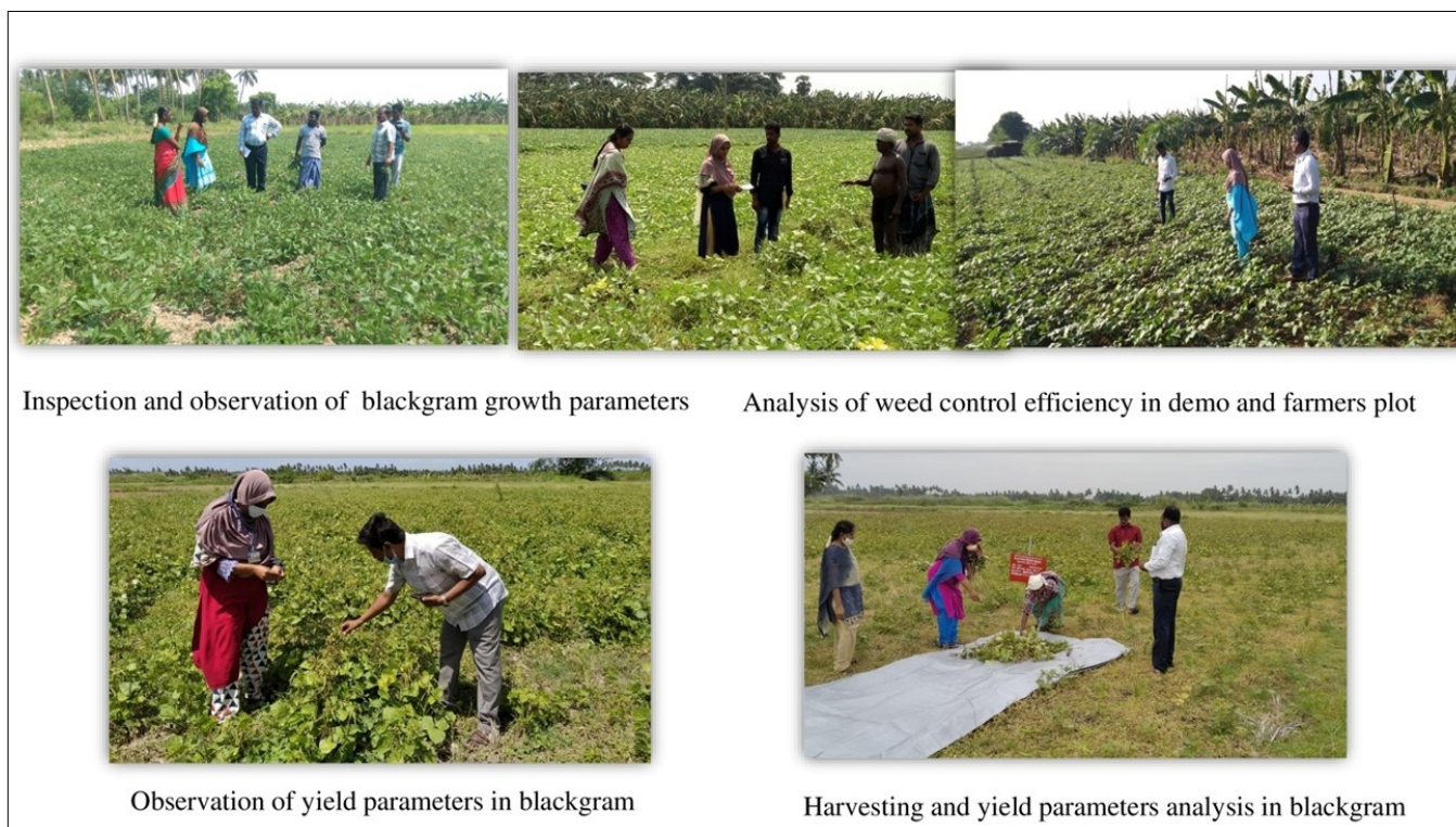
Fig. 4. Photos on observation of growth, weed infestation and yield parameters in blackgram