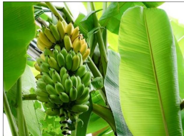
Fig. 2. Performance of banana in closer spacing and bunch size of the banana.