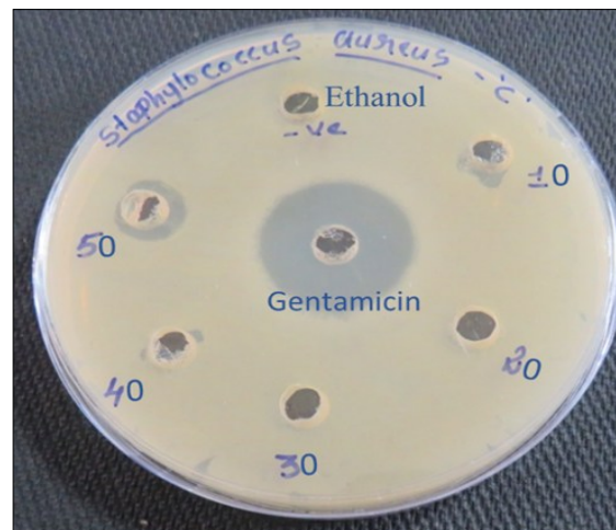
Fig. 3. Antibacterial activity of C. cristata flower against S. aureus (10 - 50 are concentration in \mu L).

acid was positive (0.3), suggesting a weak or unfavourable interaction with the target. The binding potential of tetrasiloxane, decamethyl and butane derivatives is moderate, with scores ranging from -2.9 to -3.8. Cyclotrisiloxane, hexamethyl-, recorded a score of -3.1, which indicates a weak interaction (Table 2). The stronger binding of diphenyl sulfone is supported by a variety of interaction types, including