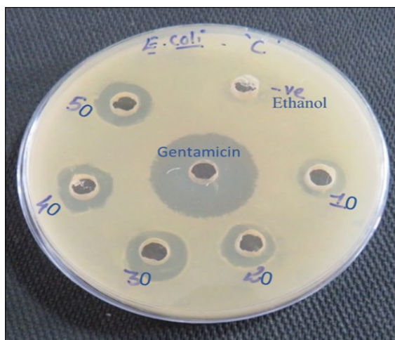
Fig. 2. Antibacterial activity of C. cristata flower against E. coli (10 - 50 are concentration in \mu L).

acid was positive (0.3), suggesting a weak or unfavourable interaction with the target. The binding potential of tetrasiloxane, decamethyl and butane derivatives is moderate, with scores ranging from -2.9 to -3.8. Cyclotrisiloxane, hexamethyl-, recorded a score of -3.1, which indicates a weak interaction (Table 2). The stronger binding of diphenyl sulfone is supported by a variety of interaction types, including