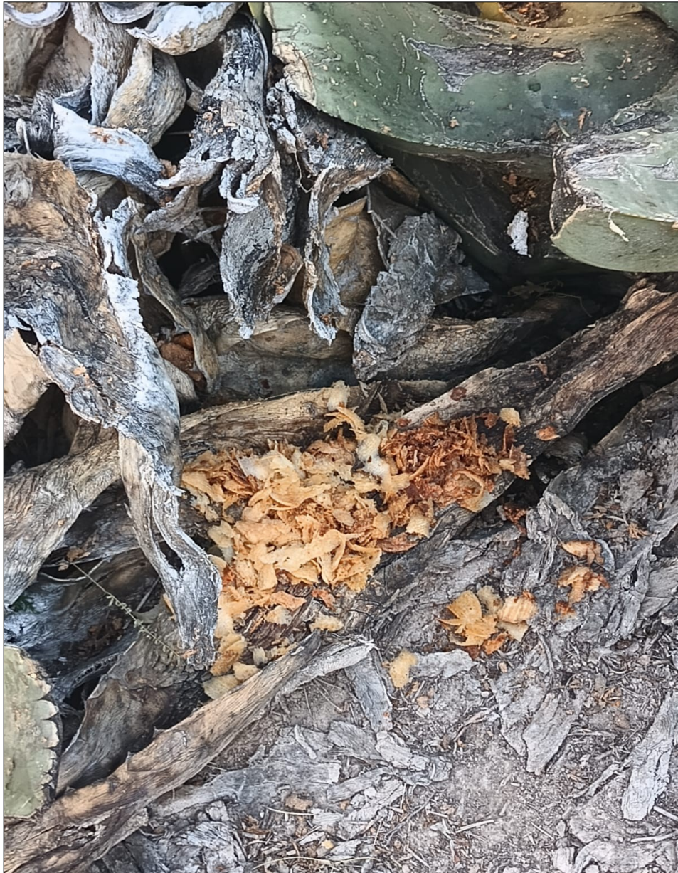
Fig. 5. Bagasse of A. salmiana .