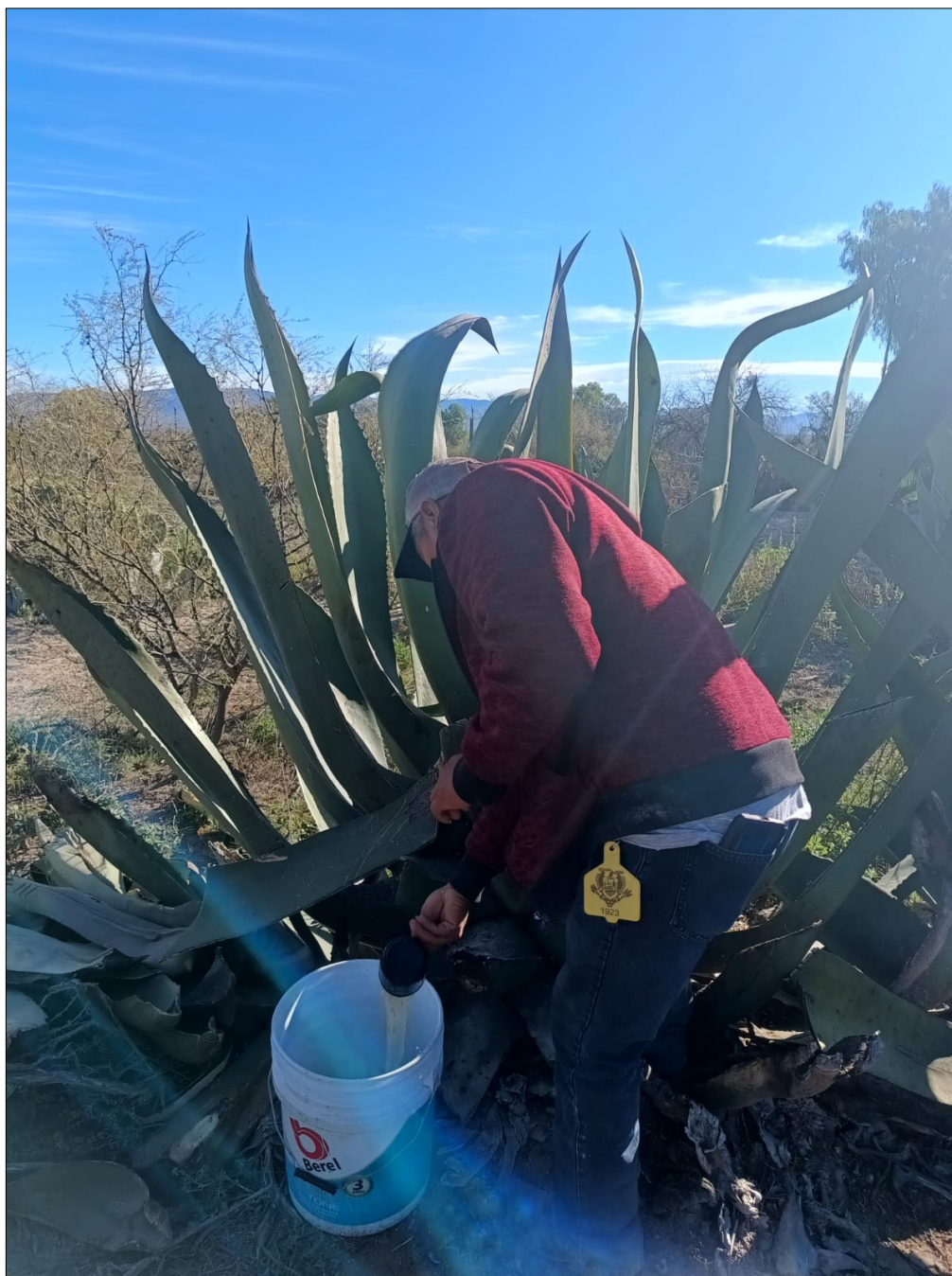
Fig. 4. Agave salmiana sap extraction, Las Mangas ejido. Saltillo, Coahuila.

It represents a cultural fusion, combining Spanish baking techniques with indigenous ingredients such as pulque (45). In the preparation of pulque bread, four main ingredients are utilized: flour, pulque, lard and sugar. Sugar is dissolved in the pulque and combined with lard in the center of the flour. Pulque serves as the fermenting agent for the flour, a process occurring in multiple stages. Initially, during kneading, the ingredients are exposed to oxygen, promoting fermentation by yeasts that metabolize the free sugars in the flour. The second fermentation stage takes place when the dough is left to rest for a period of 3-4 hr. Finally, the last fermentation stage occurs once the dough has been shaped into its final form and divided into pieces. These last two stages occur at room temperature, influenced by climatic conditions. Traditionally, pulque bread is baked in wood-fired ovens, with baking time determined by the oven's incandescence and the baker's judgment (45).