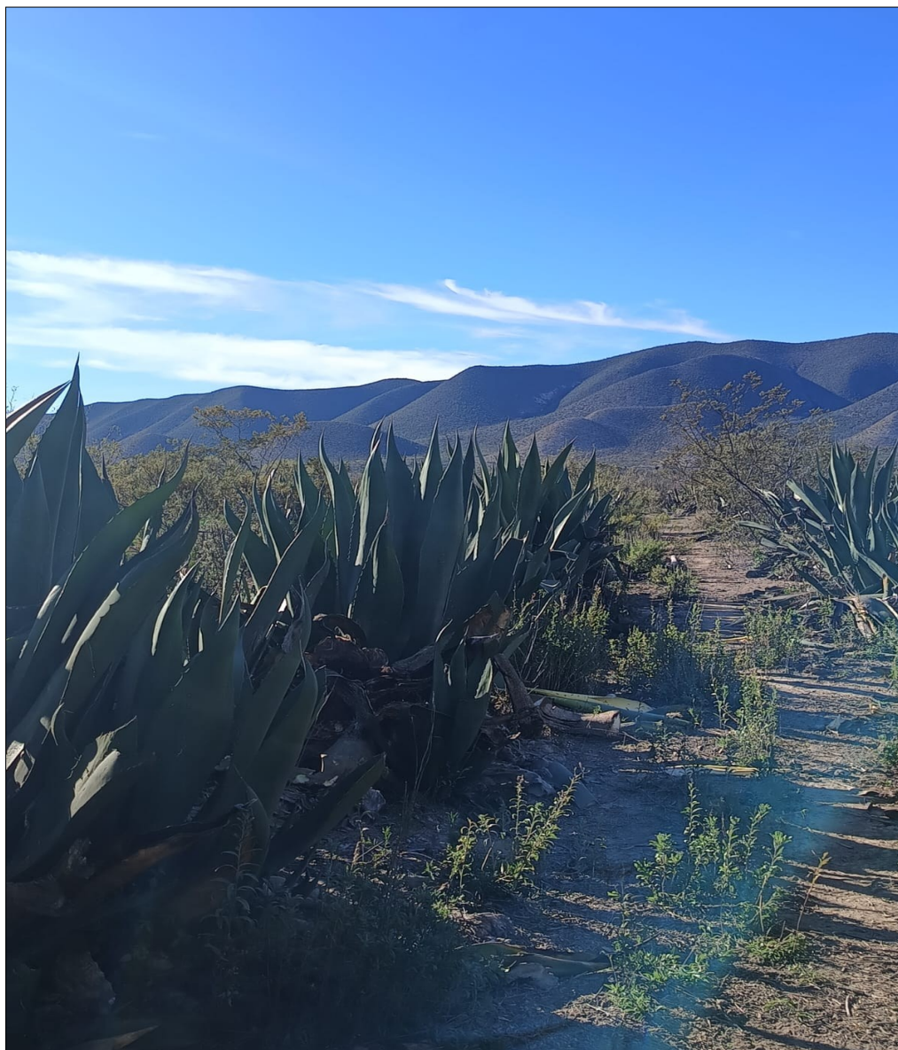
Fig. 3. Agave salmiana cultivation in Saltillo, Coahuila.

-fixing) bacterial communities present in the rhizosphere (soil region surrounding the plant roots), phyllosphere (leaf surface) and endosphere (internal spaces) of the roots and leaves. A previous study identified ten bacterial strains, including two from the Enterobacteriaceae family and one from the Stenotrophomonas genus (24). Furthermore, molecular identification of the plant's bacterial endomicrobiota revealed a greater representation of the Bacillus , Enterobacter and Leclercia genera, many of which have potential for nitrogen fixation, production of antimicrobial compounds and growth-promoting compounds (25).