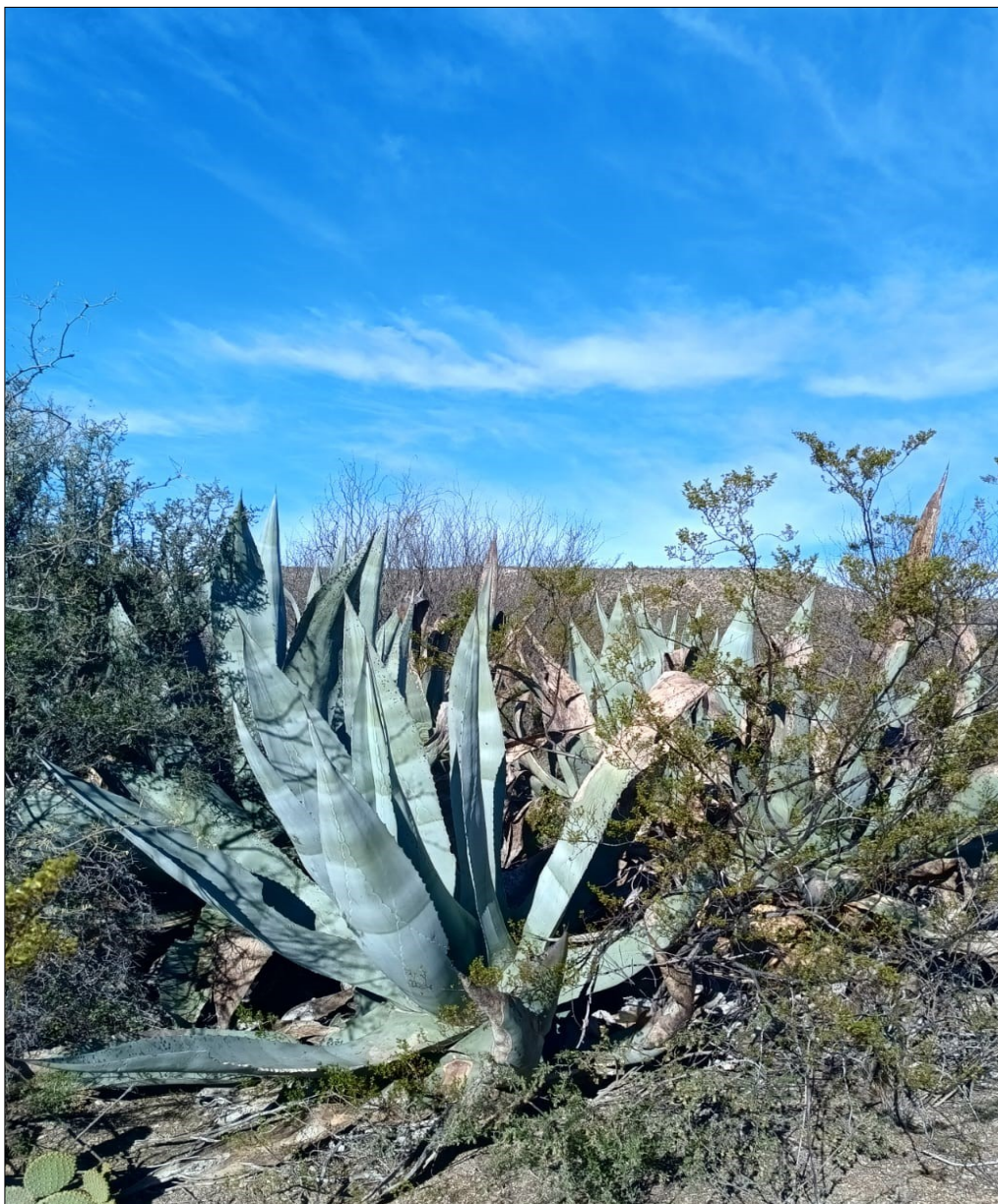
Fig. 2. Agave atrovirens plant in Saltillo Coahuila, Mexico.

Results showed that the fibers of this species are a good source of carbon and support, yielding significant amounts of endoglucanase, exoglucanase and \beta -glucosidase. The ability to hydrolyze and produce fermentable sugars from these enzymes is important for different industrial processes (18).