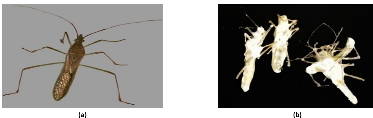
Fig. 2. Symptom of mycosis on rice bug (a) Control, (b) Mycosis on treated rice bug, Leptocorisca acuta .

The laboratory bioassays were conducted to evaluate the dose response to arrive at an accurate estimate of the virulence of an isolate. The effective dose of B. bassiana RB PTB against L. acuta was determined as 10^8 spores \text{mL}^{-1} with 100 % mortality at 120 HAT. The dose-dependent mortality observed in this study conforms with the findings of a previous study, where adult rice bugs treated B. bassiana VKA 01 showed similar dose-dependent mortality. They recorded 90.74 and 98.15 % mortality at 168 HAT in adults, when treated with 10^7 and 10^8 spores \text{mL}^{-1} , respectively (10).