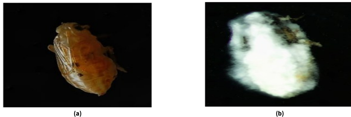
Fig. 3. Symptom of mycosis on brown planthopper (a) Control, (b) Mycosis on treated BPH, Nilaparvata lugens .