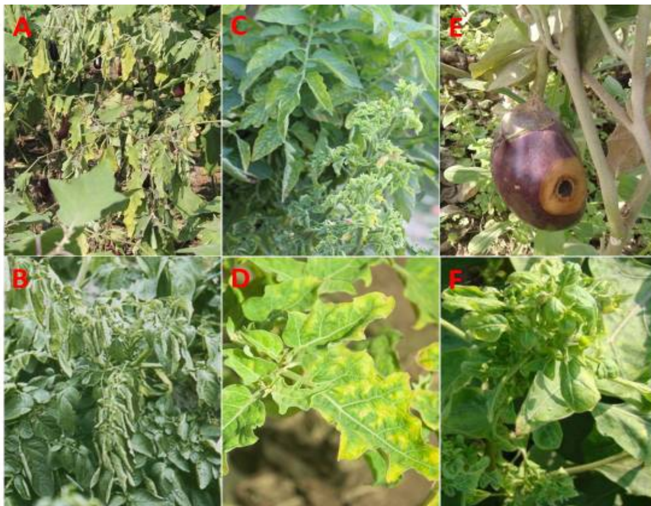
Fig. 2. Different plant diseases found during survey. A) Bacterial wilt of Brinjal, B) Bacterial wilt of Tomato, C) Viral disease of Tomato, D) Viral disease of Brinjal, E) Phomopsis blight of Brinjal, F) Little leaf of Brinjal.