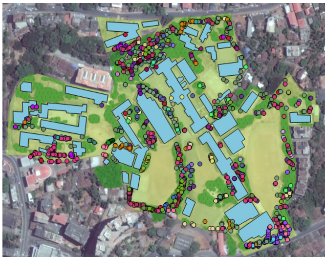
Fig. 1. Distribution of the extant tree species present on the campus are shown as coloured dots representing each species. The blue colour blocks are concrete structures within the campus, while the green region depicts the green cover.

The tree flora of St Aloysius College (12.873067N 74.845914E) campus of 14.97 ha in Mangalore was mapped using a handheld GARMEN Global Positioning System (GPS). The number of trees per species was also noted for the diversity study. The diversity indices such as the Simpsons Dominance Index (19), Shannon diversity (20), and evenness indices (21) were calculated using PAST (v3.17) statistical software.